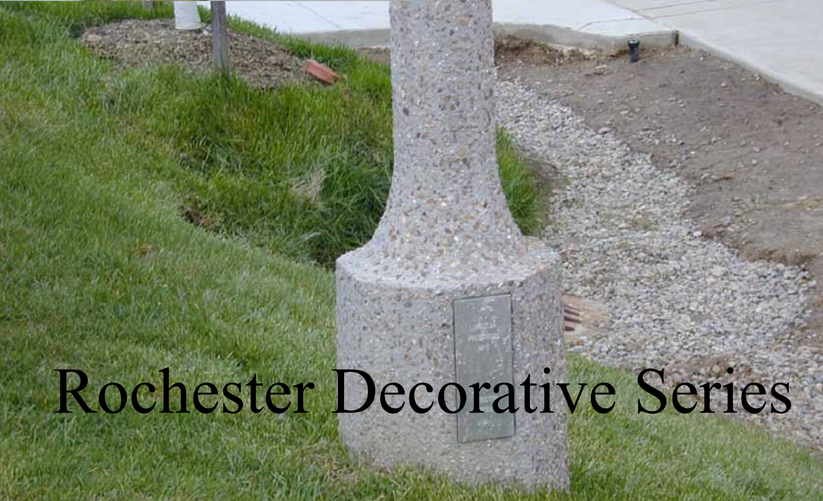
Rochester Decorative Series