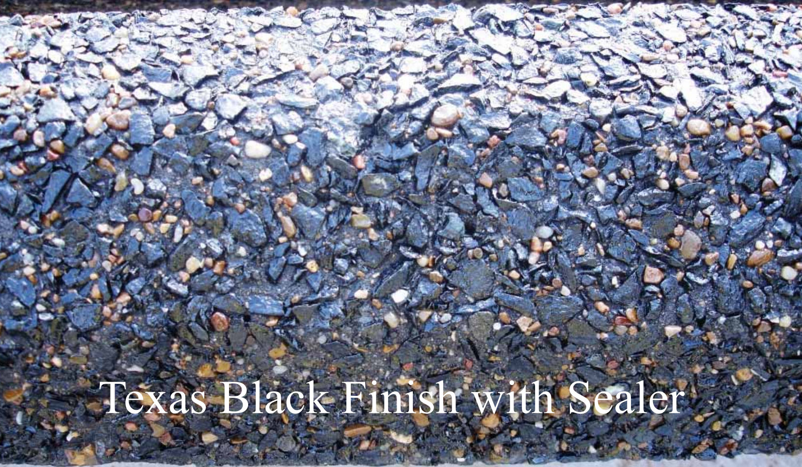
Texas Black Finish with Sealer