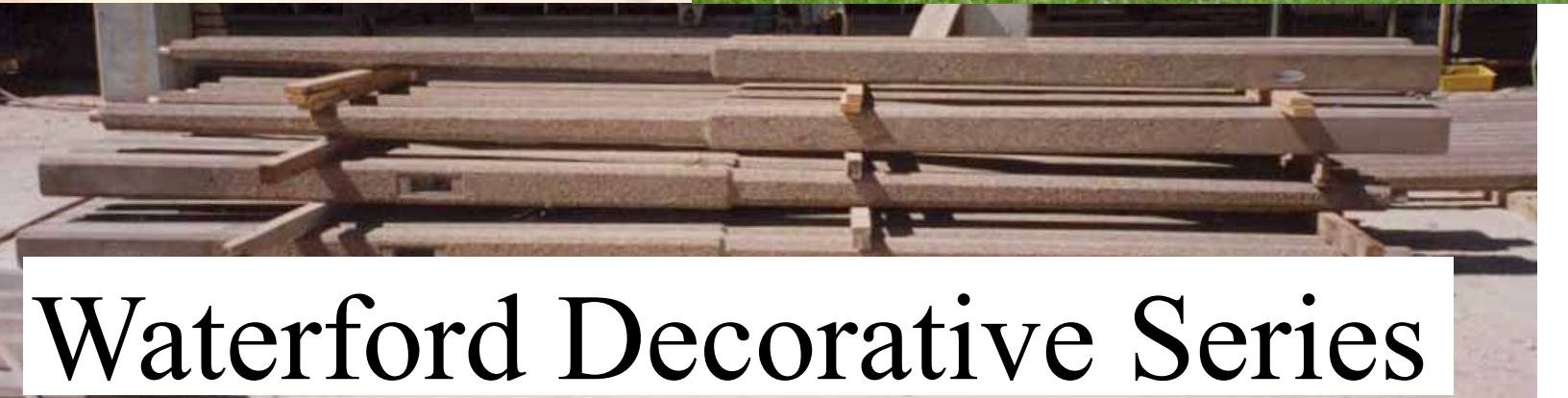
Waterford Decorative Series