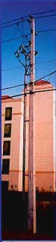
Line Rehabilitation - Wood Pole Replacement