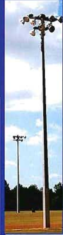
Power Distribution Pole